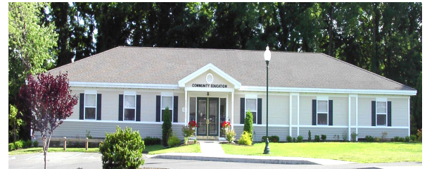
The Center for Prevention and Professional Development